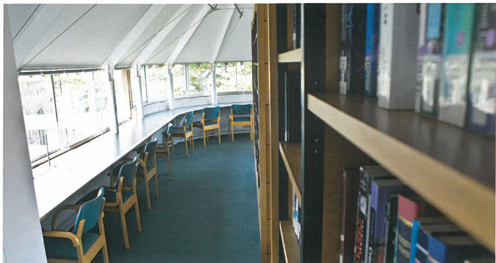
Garden Wing, Third Floor, the Working Library.